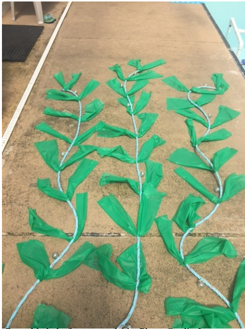
Reusable kelp forest— poolside.

Materials: scissors, green plastic table cloth, twisted polypropylene rope, fishing floats (or used Christmas ornaments), dive weights, reusable zip ties