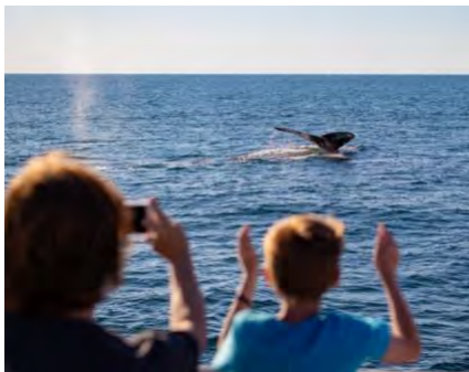
National marine sanctuaries are great places to view our planet's largest mammals in their natural habitat.