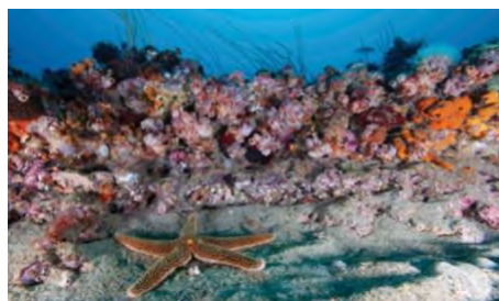
National marine sanctuaries are home to a wide variety of habitats.

The National Marine Sanctuary System serves as a model for community involvement in the protection and management of public resources. National marine sanctuaries are beacons of hope and places of solutions. The successes across the National Marine Sanctuary System show that conservation, economic prosperity, and human well-being