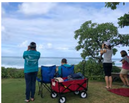
Volunteers get involved in national marine sanctuaries in many ways, such as participating in whale counts.