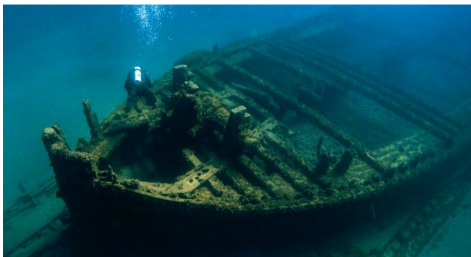
As a seafaring nation, America's greatest museum of our past lays on the bottom of the sea and lakes in the National Marine Sanctuary System.

Each national marine sanctuary and marine national monument has its own unique history and purpose, set aside for both protection and enjoyment, now and in the future. Decisions about how to best manage these special places are made using the best available scientific information, as well as extensive public input.