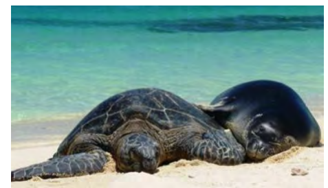
Many endangered or threatened species are found in these places.

sanctuaries.noaa.gov Facebook: NOAA Office of National Marine Sanctuaries Instagram: @noaasanctuaries X: @sanctuaries Tumblr: @noaasanctuaries YouTube: @sanctuaries LinkedIn: NOAA's Office of National Marine Sanctuaries