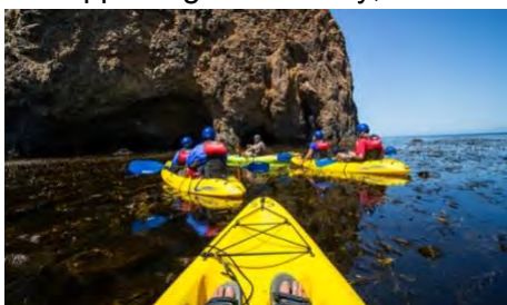
Sanctuaries provide idyllic settings for many recreational activities.

From land to sea, the waters and ecosystems of national marine sanctuaries and monuments connect people and communities through science, education, and stewardship. They support coastal communities and drive local economies. They provide jobs and opportunities for people to discover, recreate, and form lifelong connections with some of the most iconic places on the planet. Many of the habitats within national marine sanctuaries provide ecosystem services, such as supporting biodiversity,