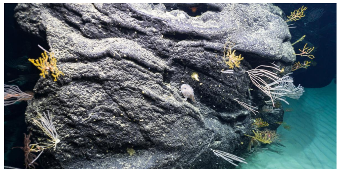
Deep sea corals and sponges on a boulder in the Line Islands north of Kingman Reef.

priorities of the science and resource management community to close knowledge gaps in our unfolding understanding of our changing ocean planet. The E/V Nautilus 2023 expeditions are sponsored by NOAA Ocean Exploration via the Ocean Exploration Cooperative Institute, Ocean Networks Canada, the Office of Naval Research, and the Bureau of Ocean Energy Management.