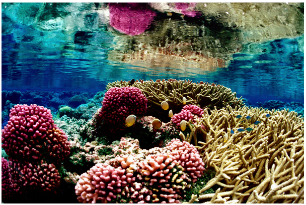
Branching corals grow on a vibrant shallow reef at Palmyra Atoll National Wildlife Refuge.

On March 24, 2023, President Biden directed the Secretary of Commerce to consider initiating the designation process for a proposed national marine sanctuary in the Pacific Remote Islands. On April 17, 2023, NOAA's Office of National Marine Sanctuaries issued a Notice of Intent to Conduct Scoping and to Prepare an Environmental Impact Statement for the Proposed Designation of a National Marine Sanctuary for the Pacific Remote Islands, launching the designation process. The proposed sanctuary designation would allow NOAA to augment the existing protections for the Pacific Remote Islands Marine National Monument with additional regulatory and non-regulatory tools, and to conserve additional areas outside the monument's existing boundary. The proposed sanctuary would not include terrestrial areas or diminish the protections of the existing monument designations.