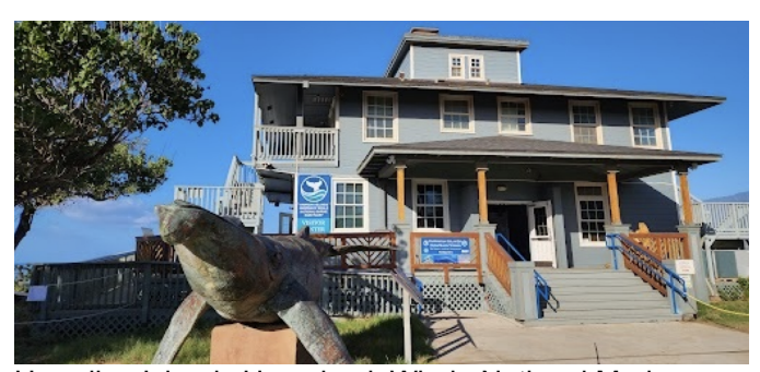
Hawaiian Islands Humpback Whale National Marine Sanctuary's visitor center is in Kīhei, Maui.

The Department of Commerce and NOAA announced it will invest nearly $50 million from the Inflation Reduction Act to make infrastructure improvements to facilities at six national marine sanctuaries across the country. In the Pacific, NOAA intends to invest $17 million to help build climate resilience in the Kīhei, Maui visitor and community center for Hawaiian Islands Humpback Whale National Marine Sanctuary, which will mitigate threats from upland flooding, powerful storms, and sand inundation. Funds would also support construction of a boathouse for the sanctuary's 38-foot boat Koholā (humpback whale) that is used for large whale research and entanglement response. The National Marine Sanctuary System protects some of the most iconic underwater place throughout the United States, and these investments will make the facilities, including visitor and community centers, more resilient to climate change, improve the facilities' capacity to engage in research and conservation, and help NOAA inspire the public to be good stewards of our coasts, Great Lakes, and ocean.