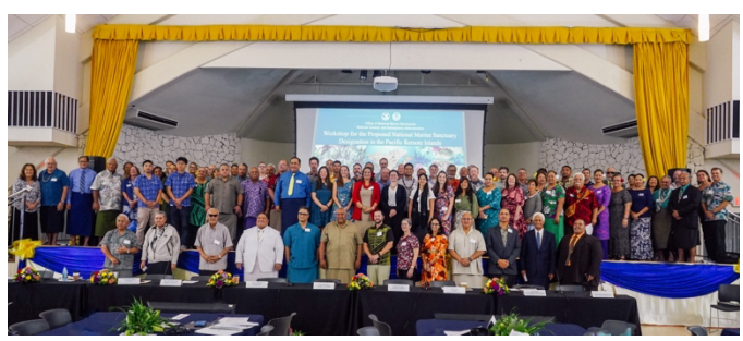
More than 230 federal and territorial representatives and stakeholders participated in a workshop in Pago Pago.

Information and discussions will help inform the development of the draft sanctuary designation documents, including a proposed rule (i.e. proposed regulations), draft environmental impact statement (per the National Environmental Policy Act), and draft management plan. NOAA anticipates releasing these documents for public comment in 2024.