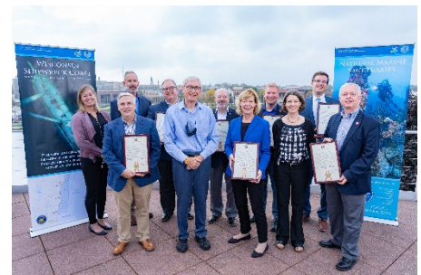
National, state and local partners gather during a sanctuary media event in October.