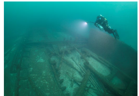
An archaeologist captures images for a 3D photo-model.

In June 2022, a team of sanctuary archaeologists and filmmakers conducted assessments of 10 sanctuary shipwreck sites and captured video and virtual reality footage. Geophysical surveys were conducted at these and additional sites, as well as 3D modeling. This work was a precursor to installing permanent mooring systems in 2023. Additionally, two teachers joined the team for an immersive "teacher-at-sea" experience. Much of the footage was utilized by Discover Wisconsin, who created a promotional video and companion podcast that have over 70,000 views to date.