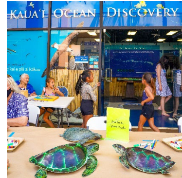
The sanctuary visitor centers have reopened.

Sanctuary visitor centers on Maui and Kaua'i are open to the public and have held outreach events with partners on the islands of O'ahu, Hawai'i and Maui. Kaua'i has been distributing "Grab and Go" learning kits to students during school breaks, and school groups are back attending classes at the Maui Site. Team Ocean volunteers went back on the water to share best viewing practices with kayakers and stand up paddle boarders and Maui started a new citizen science "Turtle Patrol" program, sharing best practices for viewing turtles with our visitors.