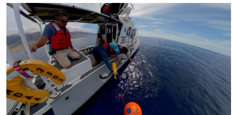
Sanctuary researchers deploy an acoustic monitoring array.

In April 2022, the sanctuary completed four years of participation and leadership in the National Sanctuary Soundscape Monitoring project (SanctSound) that culminated in the release of the SanctSound data portal. The sanctuary also continued long-term efforts to acoustically monitor Hawai'i's humpback whale population acoustically, which led to a publication in the journal Frontiers in Marine Science titled "Male humpback whale chorusing in Hawai'i and its relationship with whale abundance and density." This work combined acoustic monitoring with visual surveys and was featured in a PBS documentary titled Vanishing Whales .