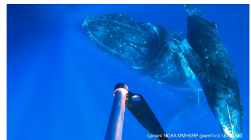
Sanctuary staff cut a humpback whale free of an entangling rope.

The sanctuary marked its 20th anniversary leading a community-based Large Whale Entanglement Response Network that has freed more than 40 whales, while garnering valuable information to help mitigate this global threat. The 20th season was the sanctuary's busiest, with staff removing more than 3,400 feet of entangling gear in 12 on-water responses benefiting six whales over two months. Sanctuary staff also completed their 18th seasonal detail, conducting 115 large whale entanglement response trainings in Alaska, the principal feeding ground for the same humpback whales that breed and calve in Hawai'i's sanctuary waters.