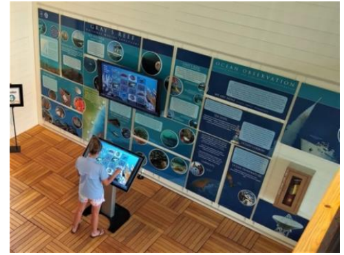
A sanctuary exhibit was installed in the new Tybee Island Marine Science Center.

The sanctuary created virtual outreach products that can be strategically deployed in numerous settings and easily updated. The sanctuary installed multimedia touchscreen galleries that offer interactive films, games, underwater photos, and stories of Gray's Reef in partner facilities in South Carolina and Georgia. Using grant funds from the National Marine Sanctuary Foundation, The Nature Conservancy worked with the sanctuary, the South Atlantic Fishery Management Council, and the Georgia Department of Natural Resources to create the online Gray's Reef Best Fishing Practices guide to show offshore anglers how to fish sustainably at the sanctuary and elsewhere.