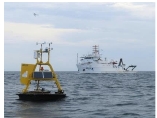
The NOAA Ship Nancy Foster served as a research platform for the sanctuary.

Gray's Reef is located on the mid-continental shelf in the Atlantic Ocean's South Atlantic Bight (SAB) and exemplifies live-bottom habitats from Cape Hatteras, North Carolina to Cape Canaveral, Florida. The sanctuary's mapping work collects baseline data to inform scientists of potential ecological connections between habitats. To foster collaboration among dozens of entities studying the SAB, the sanctuary organized a three-day workshop that documented prior knowledge about the SAB's live bottoms, what threats exist, and what possible protections might be needed. The sanctuary will publish the proceedings in early 2022.