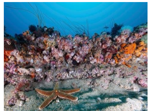
Gray's Reef National Marine Sanctuary has a diverse seafloor.