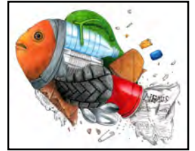
Artwork by Emmanuel R. for Bow Seat Ocean Awareness Programs

Swedish Fishing Contest: See what it's like to be an albatross hunting for food while trying to sort through an ocean of plastic trash (bottle caps, baggies, etc.). Put trash into a large bucket/bin with sweet treats (i.e., Swedish fish) hidden among the trash. Have students use trash picker-uppers to mimic a bird's beak grabbing for food.