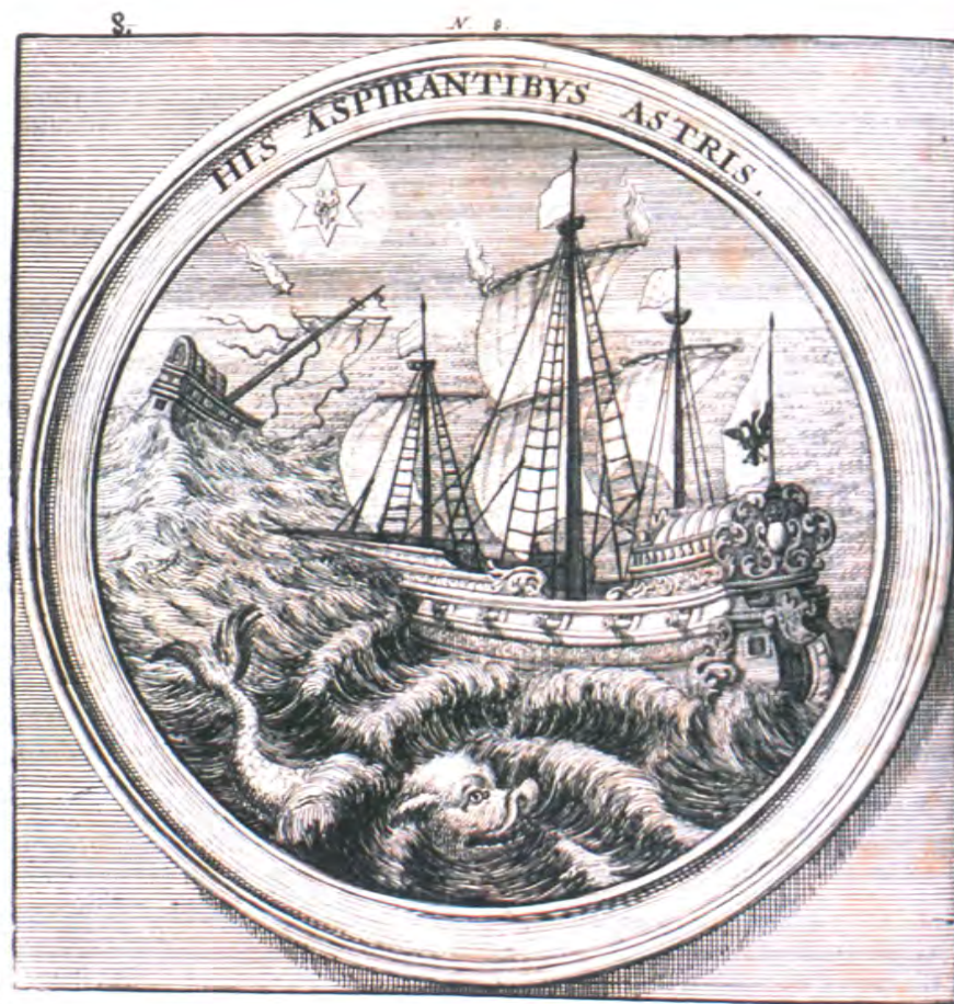
Storm, shipwreck, and sea monster.

In September 2003, NOAA’s Ocean Exploration Program visited a newly discovered shipwreck in the Stellwagen Bank National Marine Sanctuary on the coast of Massachusetts. Underwater archaeologists studied the wreck to learn more about what happened to cause the ship to sink. Now it’s your turn to be a Wreck Detective!