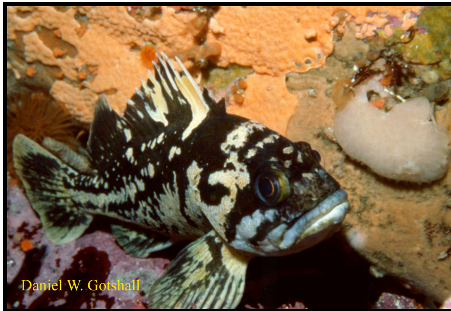
Sebastes chrysomelas , black-and-yellow rockfish