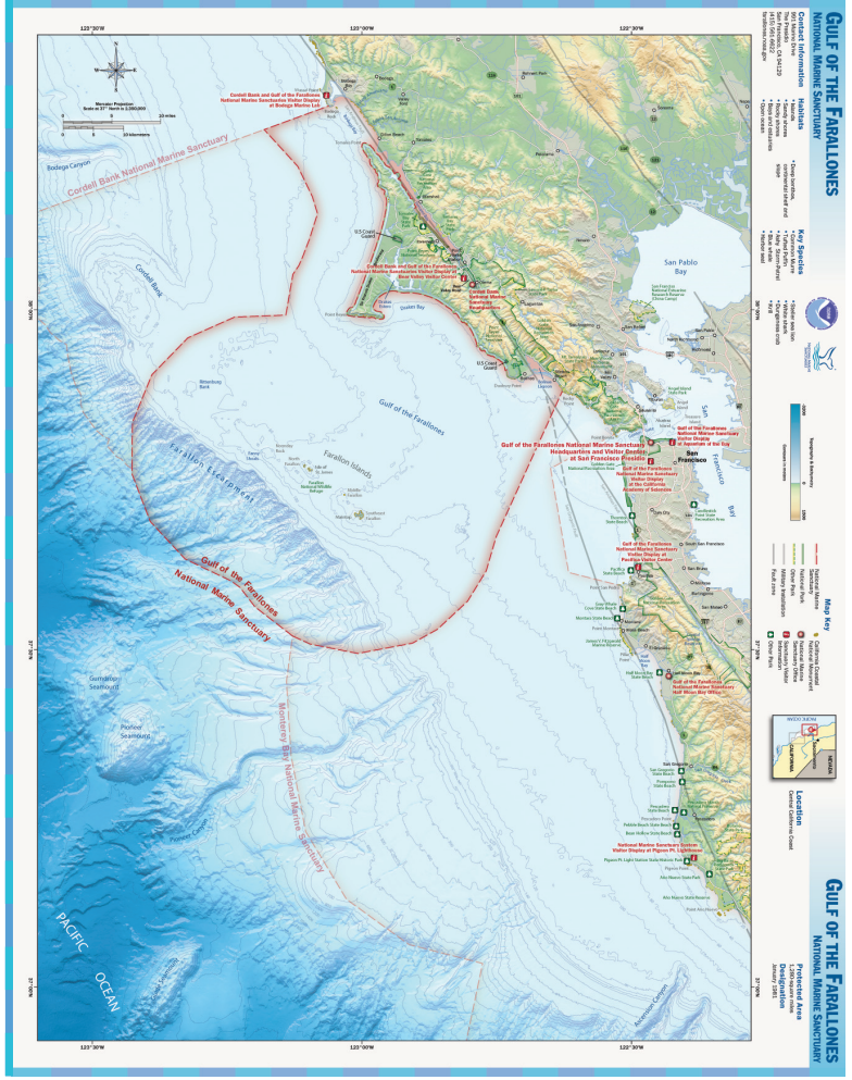
Sanctuary maps available at sanctuaries.noaa.gov

In 2008, Gulf of the Farallones National Marine Sanctuary celebrated 15 years of citizen-based ocean protection through its Beach Watch shoreline monitoring program. Launched by the sanctuary in 1993, Beach Watch was the flagship volunteer program of the Office of National Marine Sanctuaries. This long-term study uses trained "citizen scientists" to conduct regular shoreline surveys spanning 150 miles of coast from Point Año Nuevo south of San Francisco north to Bodega Head. Volunteers have also conducted sur-